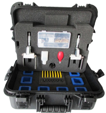
8-Cup PWL-2 Kit with Additional Micrometer

flatness. The surface can then be adjusted and the process repeated within minutes.